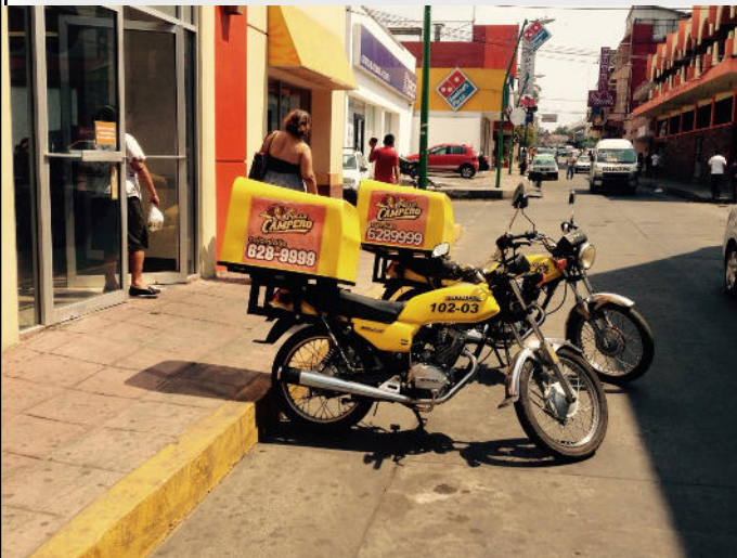
Fried Chicken delivery bikes

Common Scenes Here That You Hardly Ever See Back Home. A cozy corner perfectly suited to parking the bike while running a few errands in the shopping center. And perhaps also sneaking a discreet pee? Perhaps not. The municipality of Quetzaltenango is watching. "Do Not Urinate. $65 fine. It Is Being Filmed."