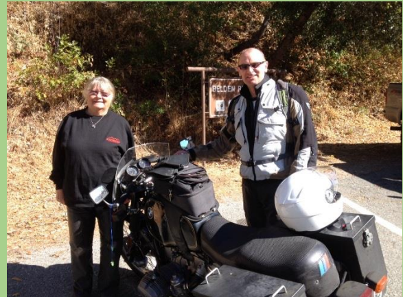
Lang & Keyes - Somewhere racking up mileage.