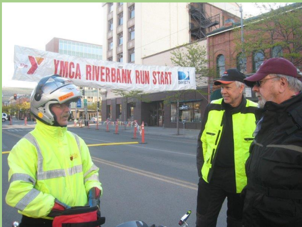
YMCA Riverbank Run