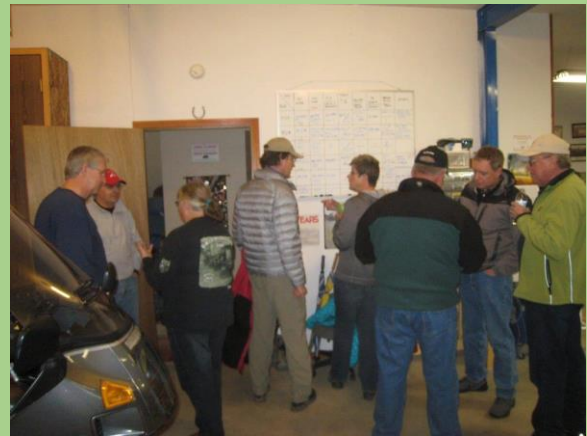
Tech Session at the Huddy Ranch