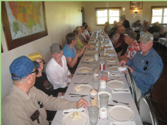
The Dinner Bell