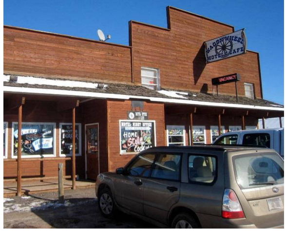
Good old comfort food at the Wagon Wheel

Too cold to ride for some but not cold enough to miss out on a little warmth and chatter at the Wagon Wheel in Drummond on the 16<sup>th</sup>. The usual suspects turned up.