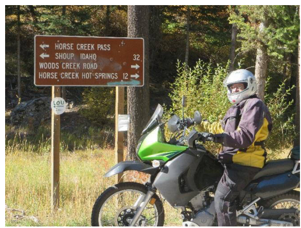
Marrea Mathews...somewhere near a sign.

JANUARY 18, 2015 DOUBLE ARROW LODGE SEELEY LAKE