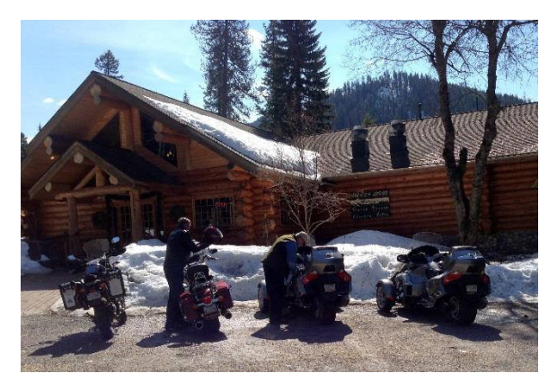
Trip to Lochsa Lodge in March 2014