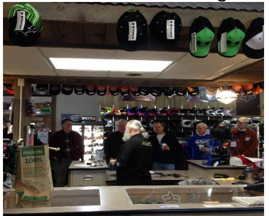
January 2014 Tech Session at Big Sky Motorsports