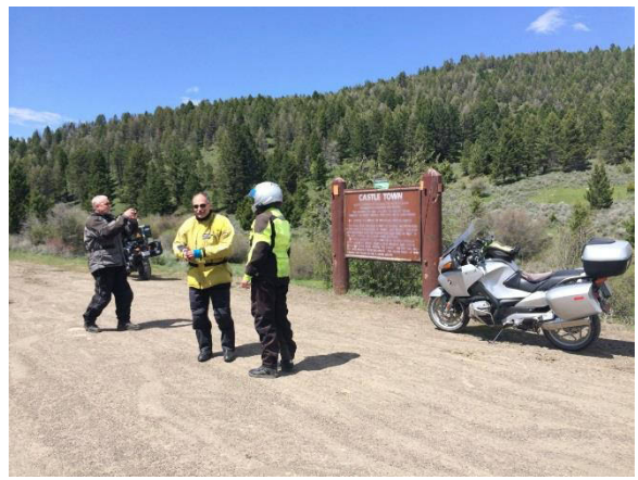
Put your helmets on.... we don't recognize you otherwise.