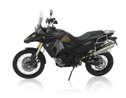
F 800 GS Adventure Come In and Check the Newest BMW's Out!

Special Offers Effective: January 01 – December 31, 2014 Ride Smart Reward