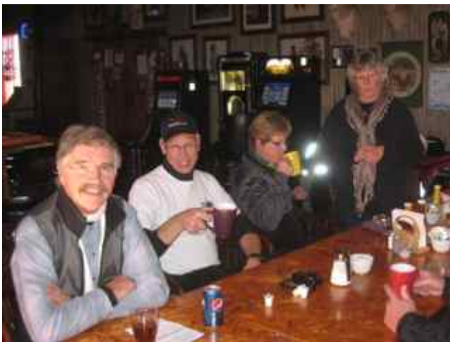
Good Food and Good Company