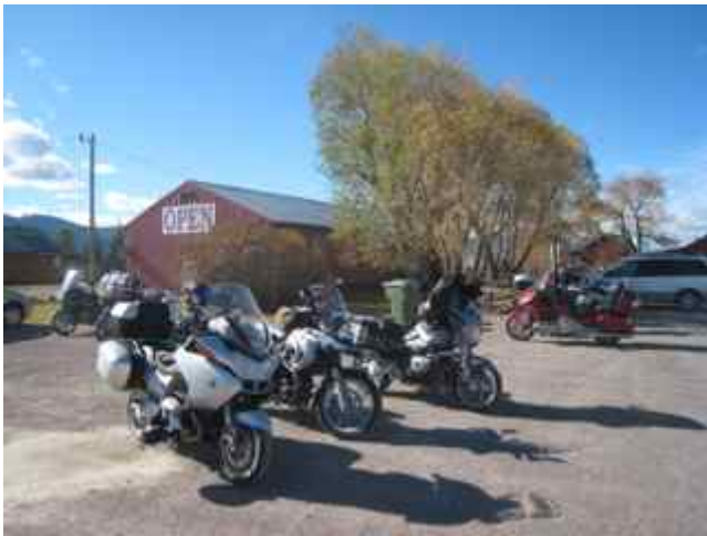
Most Rode -- We're Montanans !!