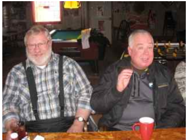
So, there was this HUMUNGOUS . . .