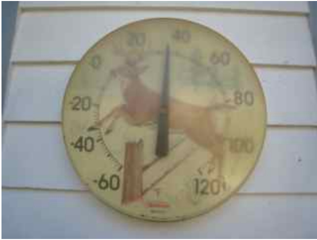
A Warm Day at Trixie's