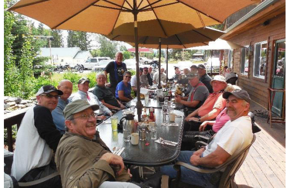
From the North end of the 18 man table.