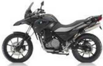
BMW G 650 GS