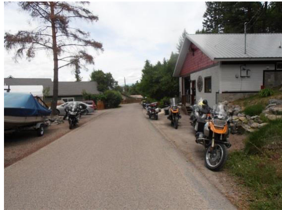
Beautiful Somers and Terry's shop.