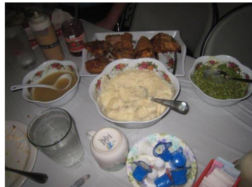
Dinner Bell family style...Yum.

We're on Facebook Too: Montana BMW Riders