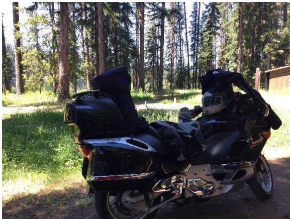
All it takes is a BMW and a tent package.

Dual Sport Ride August 7-9: We have 8 people signed up to go. The route is set and reservations made. Chuck has a cabin with room to share so contact him for luxury camping. I have a tent site that can still fit 2-4 more tents if you want to do that on the cheap. E-mail me with questions or interest.