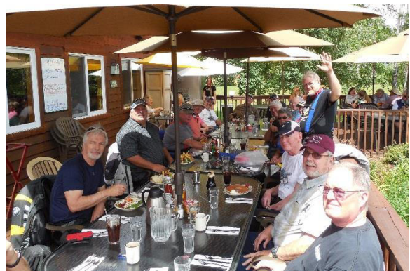
South end of the table.