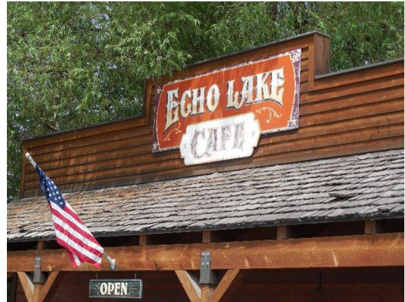
Worth the trip