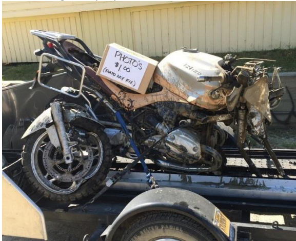
Box reads, "Photo's $1.00 Fund My Fix"

Less than 24 hrs. after the accident she was on the phone to me asking to buy my R1200R.