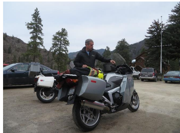
Bannister getting ready to mount up.