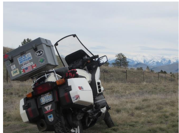
On the way to St. Ignatius for lunch.