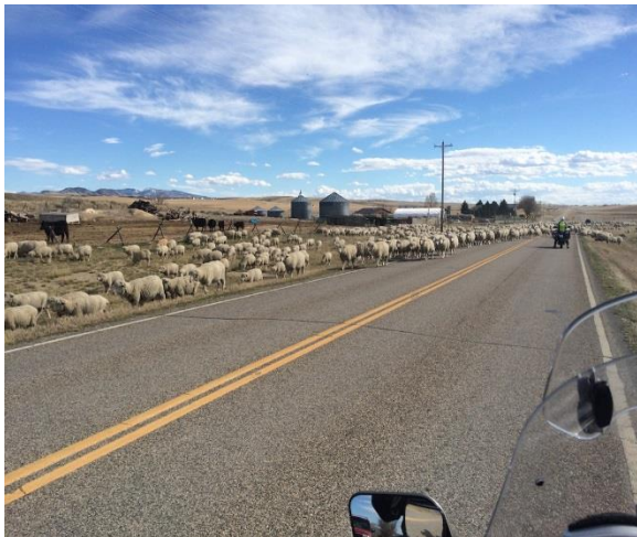
Don't know who that is up ahead, but Annie Huddy took the picture of the things we have to deal with here in Montana.

Also remember that Spring means drivers are really not used to seeing motorcycles out and about on the roads. Watch for gravel, mud from local farming communities, and cow plops, as cattle are being moved from winter to spring/summer forage areas. Sheep really don't leave much on the roads, and are generally quieter while transitioning!