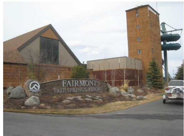
One of our favorite ride destinations.