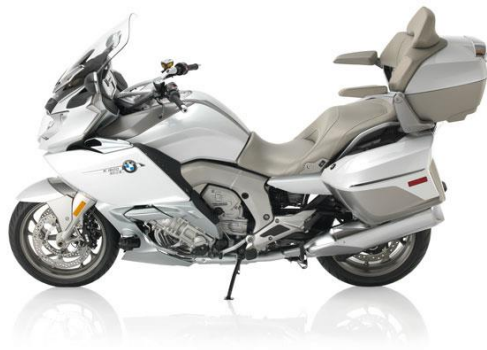
BMW K 1600 GTL

And, Nate sells KTM's, Kawasaki's and scooters besides a large selection of riding equipment, parts, and a dynamite shop with all factory trained mechanics.