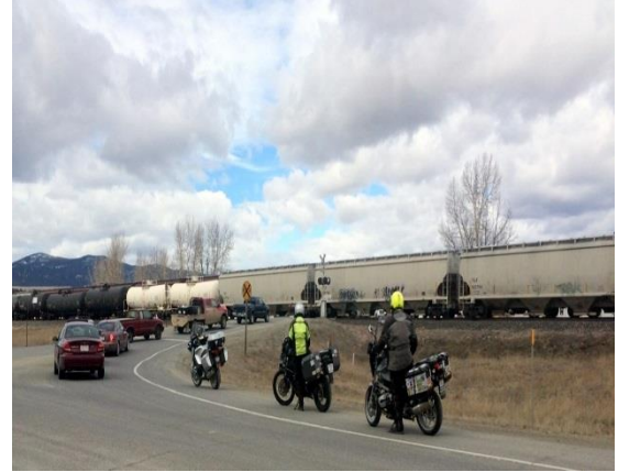
"Beemers rarely stop for anything...except trains". Submitted by Steve Moore after the Avon meeting.

www.bigskymotorsports.com for new and preowned bikes or www.bmwmotorcycles.com for the latest info on all BMW models.