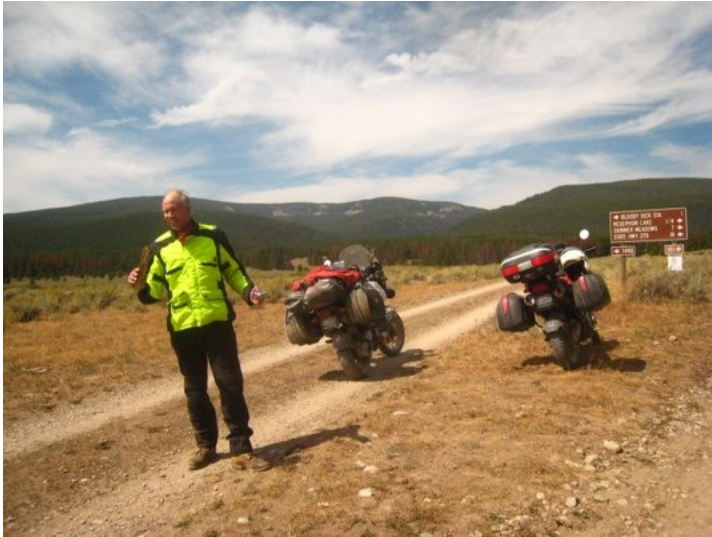
GS Ride to the Big Hole