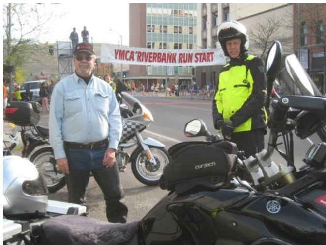
YMCA River Run