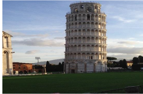
Yes, it does lean as do all the other buildings around it.