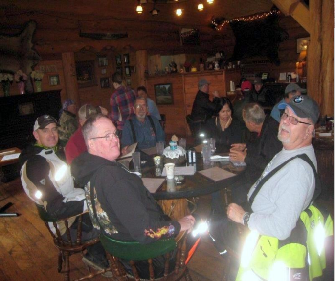
Gotta figure out how to take pictures of folks wearing their Hi-Viz wear without confusing the camera.