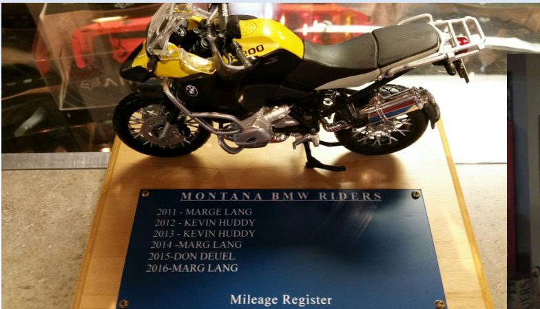
Note from the results posted on page 3, Marg Lang is the one to beat EVERY year!