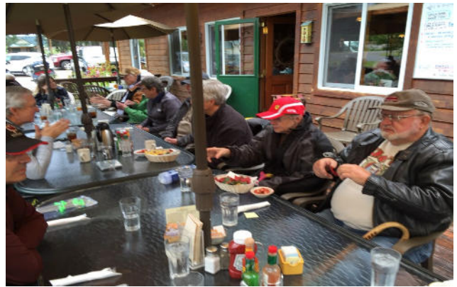
The Werre's...long time, no see. Welcome back.