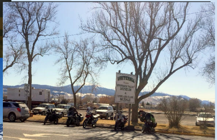
Big Hole Valley