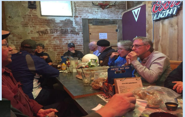
Not a bad turnout for a "bar" on day that started in the low 20 degrees.