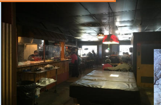
They even covered the pool table for us.