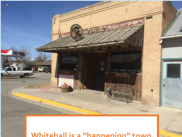
Whitehall is a "happening" town