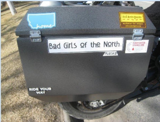
Not sure she was with us, but we voted her in.