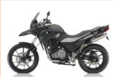
BMW G 650 GS