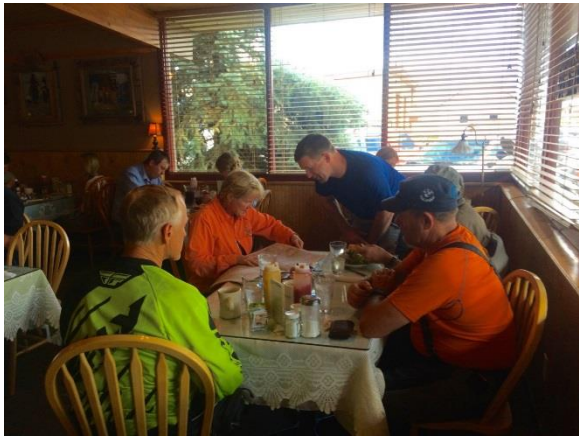
Wisdom # 2