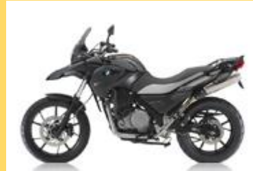
BMW G 650 GS