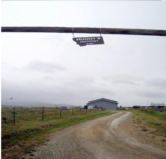
Huddy's Outpost - Home of the 2nd Annual Tech Session