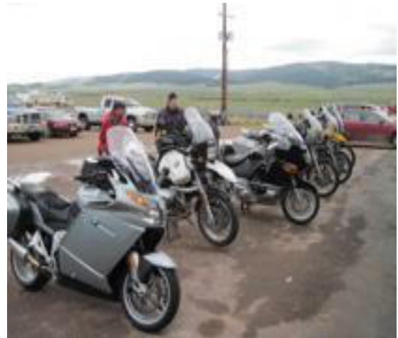
Philipsburg...several years ago.