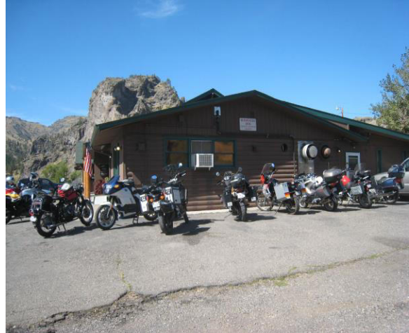
From last issue's Random Photo Quiz: Missouri River Cafe...now closed.