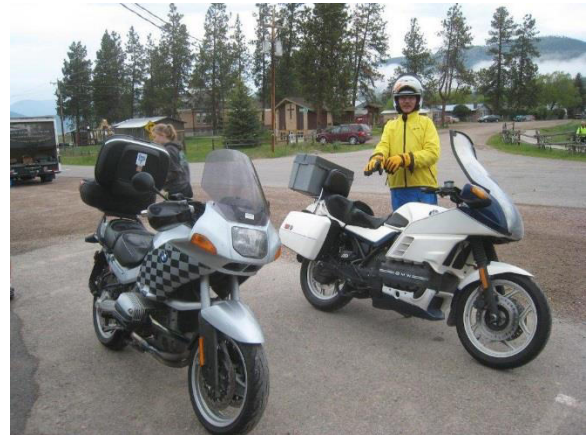
Could be any of the events this past month.