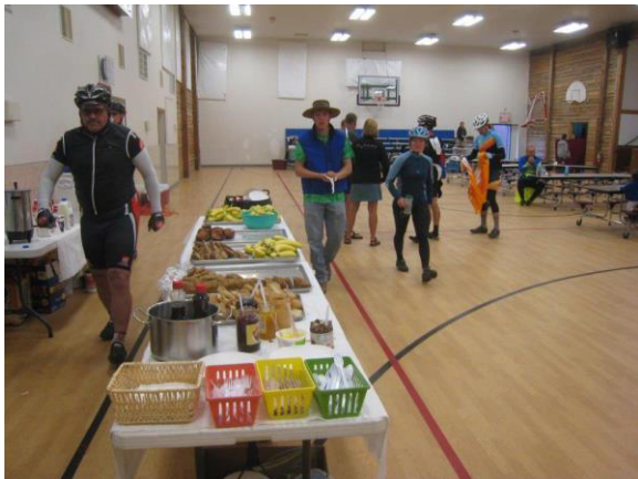
Potomac gym laid out with gobs of food for the bicyclists.