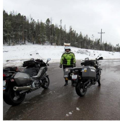
The only picture we have from the Philipsburg meeting in May – Flesher Pass. Our venerable Sec/Treas.

Check out www.bigskymotorsports.com for new and preowned bikes or www.bmwmotorcycles.com for the latest info on all BMW models.