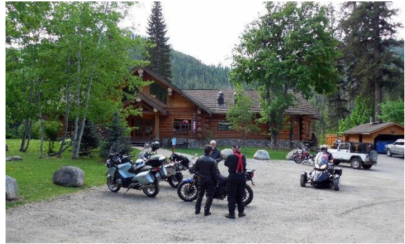
Lochsa pick up Ride