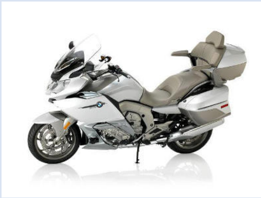
BMW K 1600 GTL Exclusive