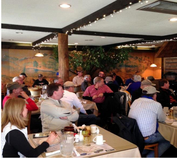
Off camera, Chuck is calling out drawing numbers.