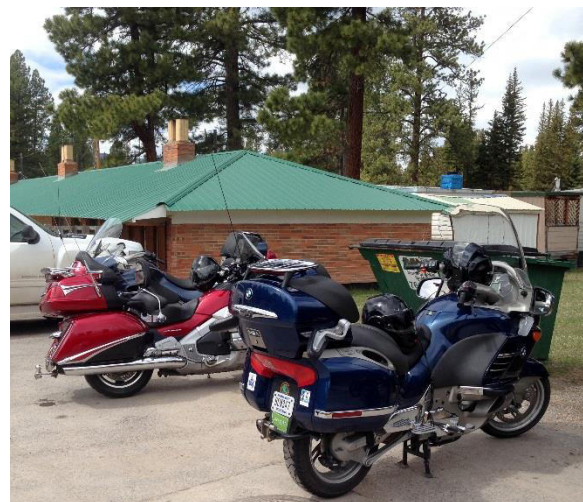
Well, not all were BMW's...we're an equal bike-atunity club.